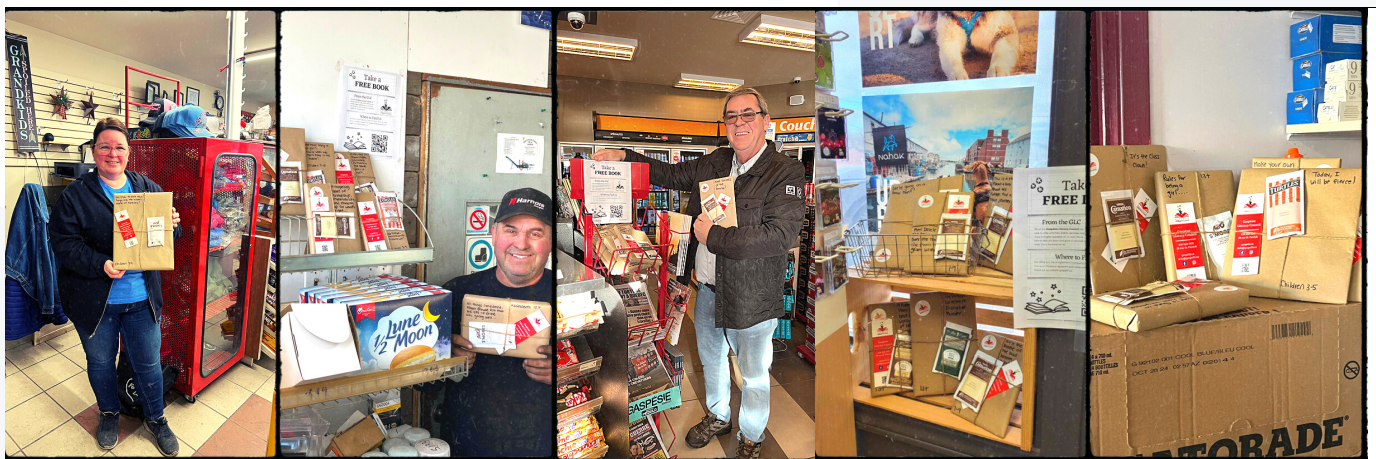
Blind Date with a Book. distributed in Gaspé businesses