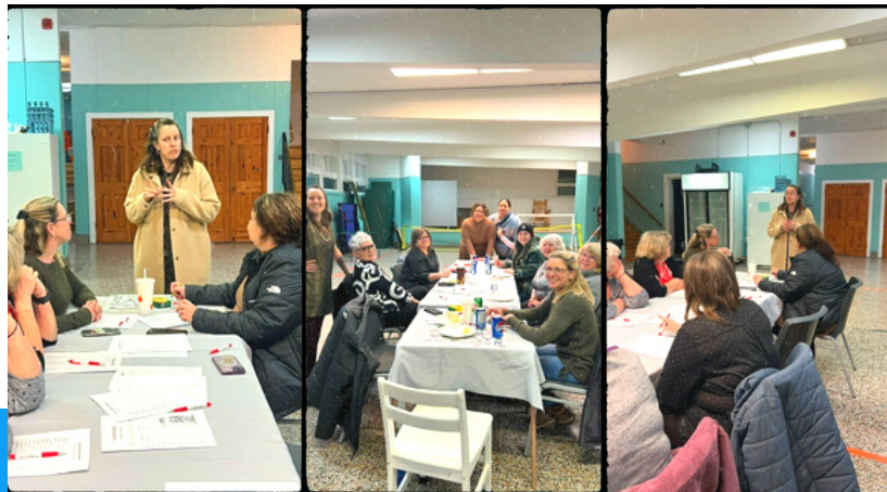
Meet Us Event